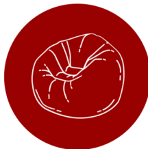
For all specifications on furniture, see section V.E. of the Terms of Occupancy