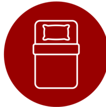
Foam/Gel Mattress Toppers