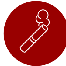
All Tobacco Products, Marijuana Products, & Vapes