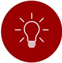
Non CFL/LED Lightbulbs