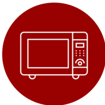
For all specifications on appliances, see sections V.B. & V.C. of the Terms of Occupancy