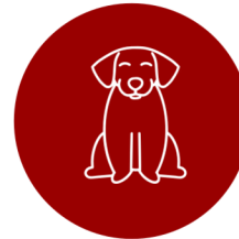
Pets Other Than Fish