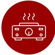
Electrical Appliances, Air Conditioners & Space Heaters