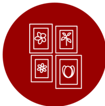
For all specifications on decorations, see section V.D. of the Terms of Occupancy